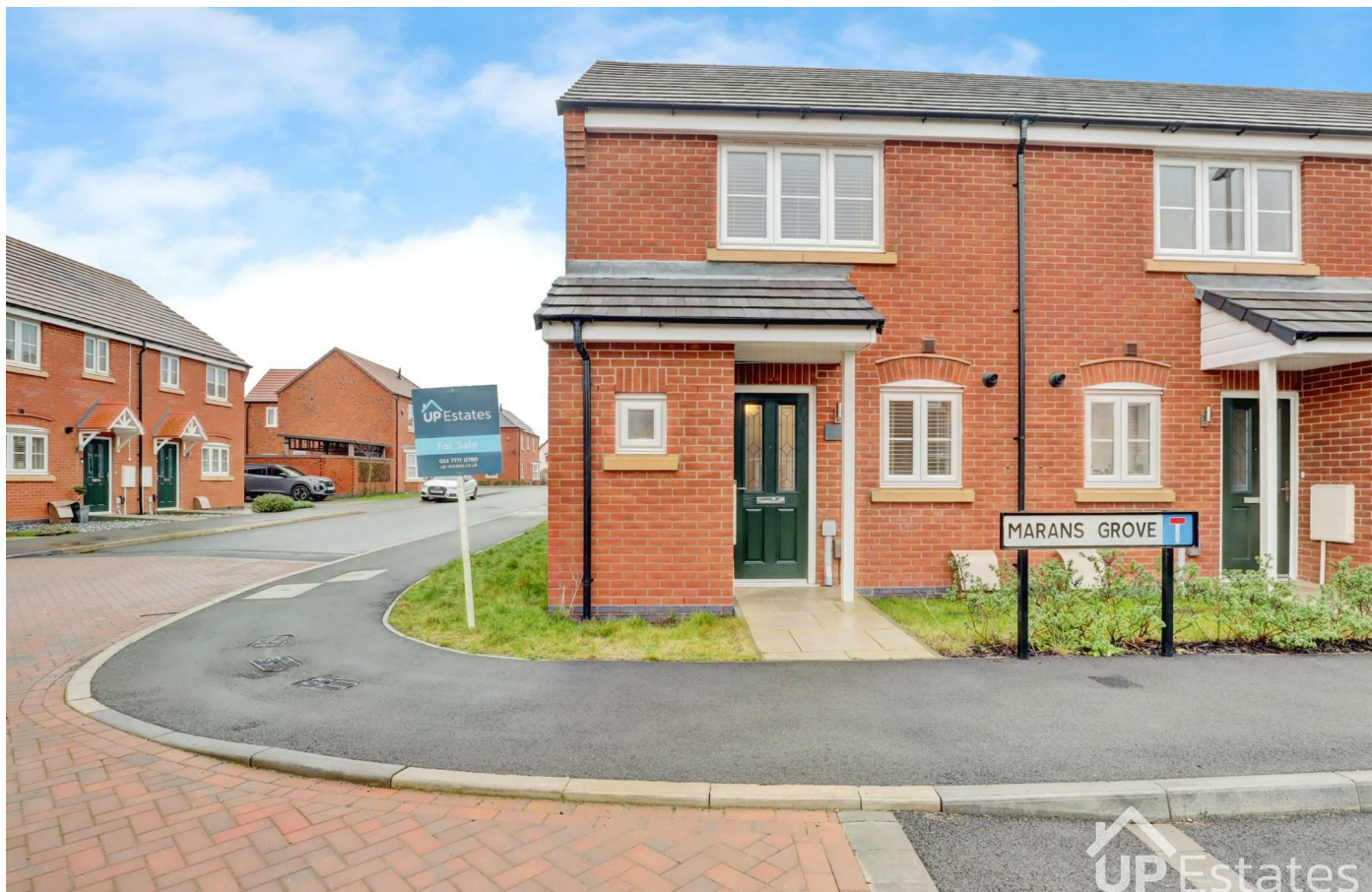
Marans Grove, Nuneaton